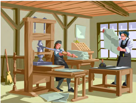
Early Printing press