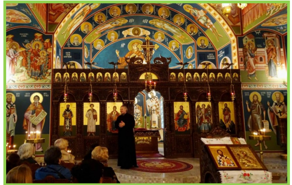
St. Sava Serbian Orthodox Church