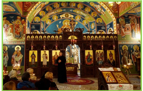
St. Sava Serbian Orthodox Church