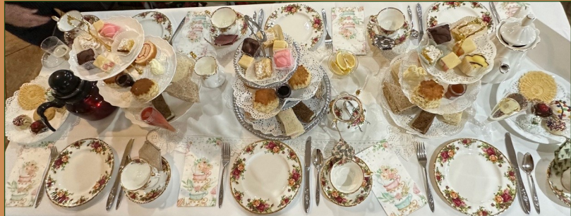
Each table was decorated in a different theme such as Winter Greetings and Mad Hatter.