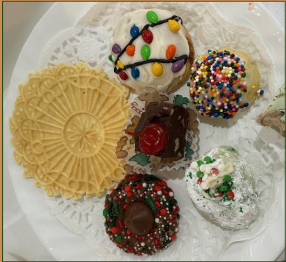
The guests all brought wonderful Christmas cookies to share and enjoy!