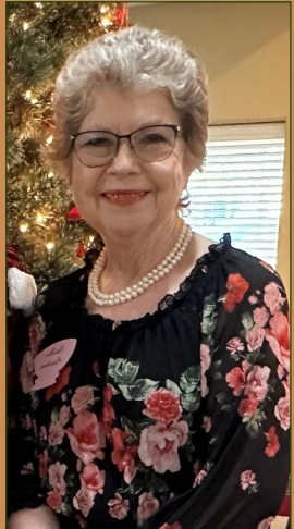
Heather Graham having fun too!