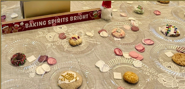
There was an optional contest for cookie taste, best decoration and more.