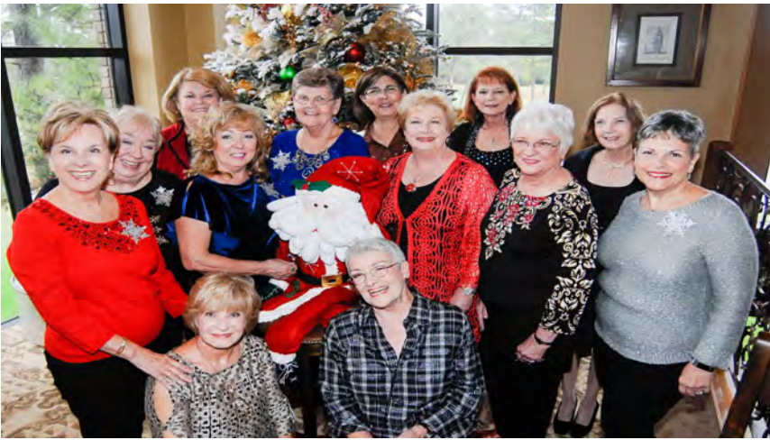
Christmas Charity Luncheon Committee